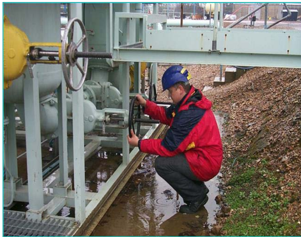
Figure 4: Industrial Human Factors Example

The above photograph shows an example of workplace design, whereby the surroundings make it inherently difficult to perform the task. The presentations as well as Case Studies are available at the Summer Institute as well as through the Minerva website [23].