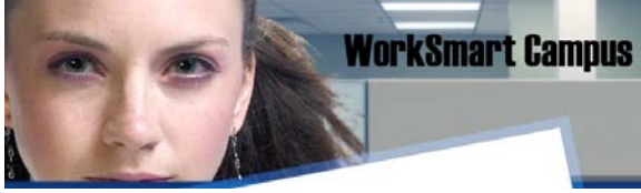
Figure 2: Worksmart e-campus

Labour has created e-learning that provides this education and has a 100 question test after completion [20].